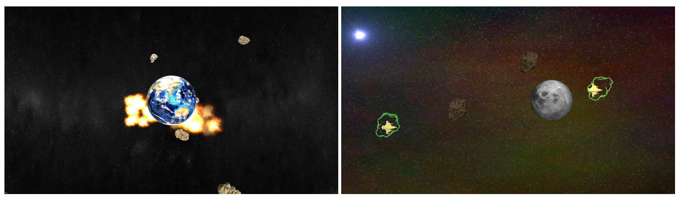
Figure 2. In the first level (left), meteoroids are flying towards earth from different angles. In the second level (right), enemy space ships are flying from left to right hiding behind meteoroids on a different depth layer.