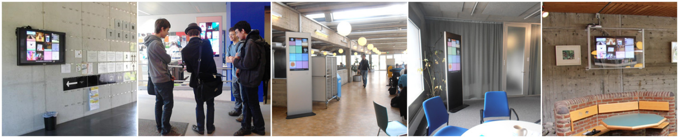
Figure 2. The five display locations with the running display client. Locations included entrance areas, cafeterias, and coffee kitchens.

The display client is depicted in Figure 2. It runs in a full screen browser and shows the 12 most recent tweets in a 3x4 grid in portrait and a 4x3 grid in landscape mode. The Twitter id to tweet to is displayed below the grid. If a tweet only contains text we just render the text and if it contains a link to a photo only the photo is shown. Each tweet is logged in a database together with a timestamp and the user's Twitter ID. If a tweet contains a link to a photo we also store the photo in the database. Hence we cannot only easily exclude explicit tweets but we can later contact the poster via his or her ID, e.g., to send an online survey.