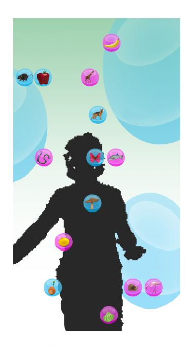
Figure 2: A user is interacting with the soap bubble game.