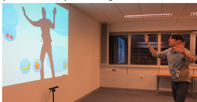
Figure 1: A user is interacting with the system perceiving EMS feedback.

Institute for Visualization and Interactive Systems University of Stuttgart {firstname.lastname}@vis.uni-stuttgart.de