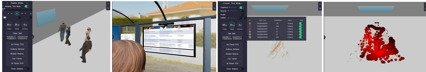
Figure 2: Our tool supports multiple modes and observational perspectives. An environmental view (a) allows the scene to be observed as if deploying a camera, whereas a user view (b) allows the visual field of view of a person interacting to be explored. In replay mode, researchers can replay the scene at arbitrary speed, whereas the static mode allows trajectories and heat maps to be visualized and analyzed.